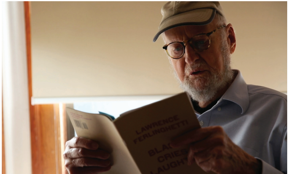
BEAT POET AND PAINTER LAWRENCE FERLINGHETTI is just too old-fashioned to appreciate the nuance of fast-paced, gadget-based tech culture.