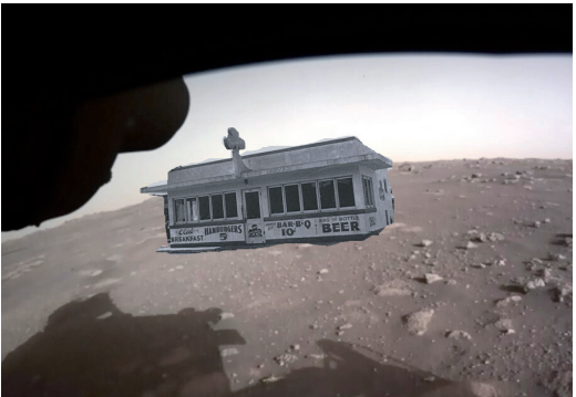
the space agency's decision to reveal THE DISCOVERY OF TAKEOUT ON MARS has the otherwise top secret Perseverance really improved Nasa's budget.

"It's the possibilities the public appreciates," explained another member of Pasadena's Jet Propulsion Laboratory's ground crew. "The public got tired of hints of ice