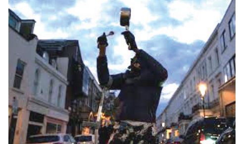
BANGING POTS AND PANS to honor the sacrifice of healthcare workers has been replaced with taking them for granted like the other frontline workers threatened with being replaced by gig workers and the urge to turn all of us into independent contractors who just get sick and die and are so much less trouble than employees.

variant requiring the same diligent care required over a year ago. Exhausted medical personnel no longer get nightly cheers and