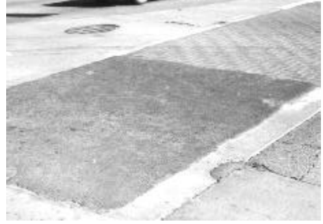
THERE IS NO QUESTION that the graceful and expensive curving new sidewalk in the "arts district" has its points, but the bold, powerful asphalt rectangles smothering the San Pablo and University Avenue brickwork is obviously the more impressive artistic statement.

Art experts unanimously awarded a coveted award for artistic excellence to Public Works recently, shattering the expectations of artists competing for "Arts District" commissions and honors.