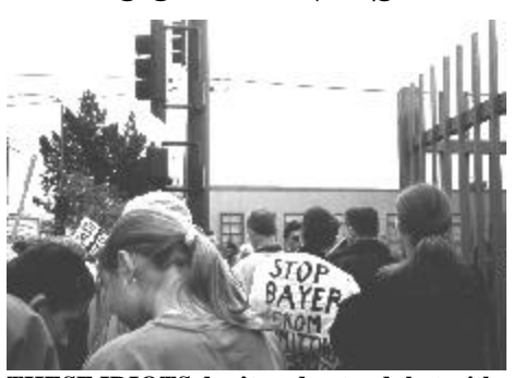
THESE IDIOTS don't understand that without big profits large, powerful pharaceutical companies would lose their will to live.