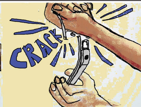
AND DON'T look back after firmly registering your dispproval.