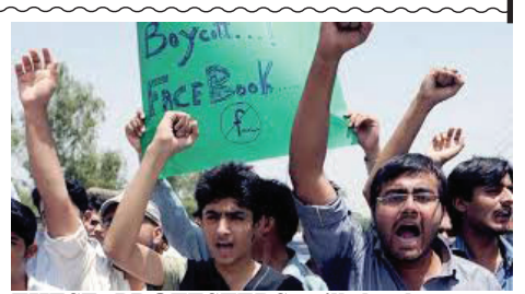
THESE PROTESTERS will be happy to know that after they were unwittingly used in an experiment on their emotions, the Facebook consent agreement was unilaterally changed by Facebook to make sure future research experiments are covered.

"People are complete sheep," he stated. "Give them good news and they get happy. Give them bad news and they get sad. Give them other people's happy news and they