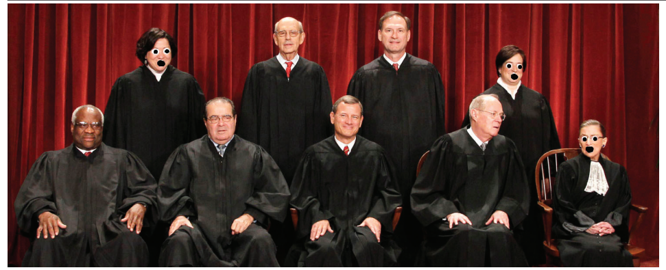
MOST OF THE MEN ON THE SUPREME COURT got the memo about keeping a straight face after the decision which gave corporations religious rights and control of womens' access to contraception, but the women need more practice.