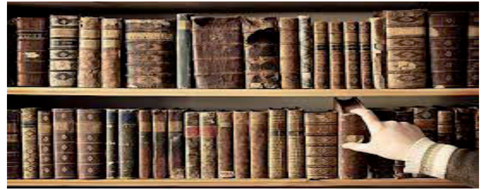
YOU'RE LOOKING FOR HELPFUL INFORMATION BEWARE of picking up a book which is apparently full of disinformation which just ought to be burned in favor of using the internet.