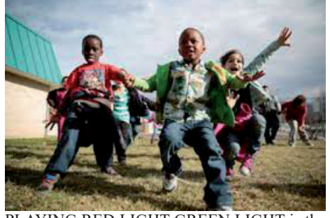
PLAYING RED LIGHT GREEN LIGHT is the closest parallel to trying to follow the dazzling array of contradictory pandemic protocols now available to anybody left still paying attention.

"It was important to just let somebody win," acknowledged another immunologist also requesting anonymity for their