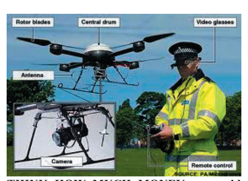
THINK HOW MUCH MONEY we could save if the police could just deploy these handy domestic drones to gunfire-ridden neighborhoods from the safety of a sunny park.

"The 'ambassadors' are just like drones,"