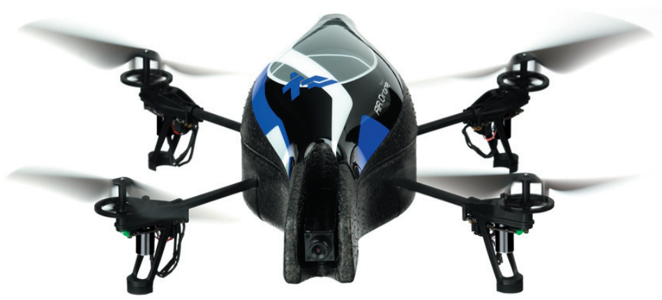
THIS LITTLE DRONE MAY NOT BE AS LOVEABLE as a kitten or a puppy dog, but it can be just as loyal a companion for older seniors who need a companion to walk with them around the neighborhood and keep an eye on them so they don't fall or take up an inappropriate interest in political activities.

Ask Lena about hot jobs available at your local merchant association at cdenney@igc.org.