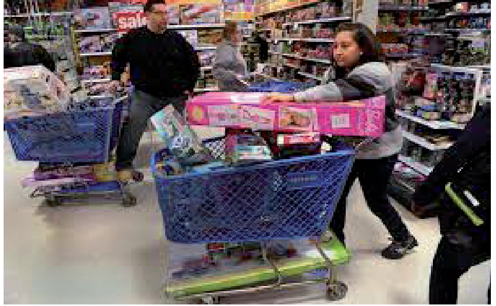
FURIOUS SHOPPERS COMPETE for products in the strange new nation-wide era of coronavirus contagion and supply chain disruption which most of them will tell you isn't really all that different from a typical day at Walmart.

"If there's no tomorrow then I'm getting those shoes..."