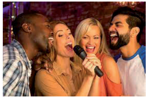
SOPHISTICATED KARAOKE MACHINES now come with sound effects, lighting, and boozy green room groupies.

economy, worried about inflation, and pessimistic about the direction of the country in general.