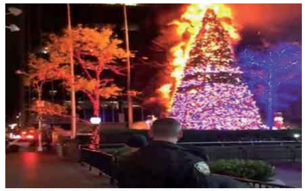
THE FOX NEWS CHRISTMAS TREE WHICH EXPLODED INTO FLAMES took people by surprise but also provided a warm place to roast marshmellows and sing Christmas carols.