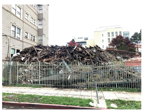
IT MIGHT LOOK LIKE RUBBLE to most people but this represents a tidy profit for a lot of politically well-connected investors who won't forget your name at election time.

"Converting public resources over to private control may have little public benefit,"