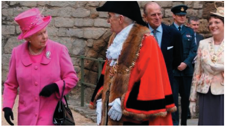
THE SUCCESS OF THE OUEEN'S HAT in beating the pants off all the other boats in the race has inspired the navy to rethink all of its militry headgear.

out of the Yanks," stated the Queen. "For a change."