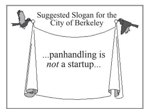
*PST's volume numbering didn't begin until six years after publication.