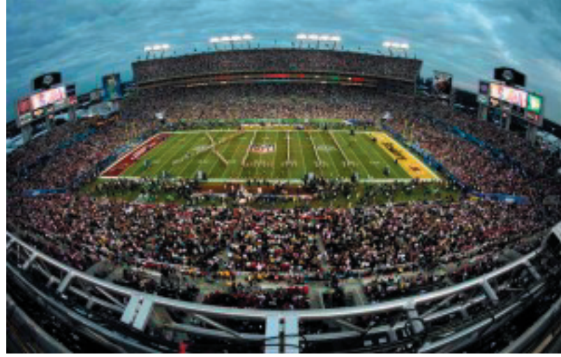
BERKELEY MAYOR TOM BATES' proposed anti-sitting law inspired thousands of angry people to rally against it in a huge, seated show of opposition at a local stadium.

Berkeley Mayor Tom Bates, backed by the Office of Economic Development, has definitively determined that homeless people, poor people, young people, and disabled veterans are responsible for Berkeley's perception of economic decline.