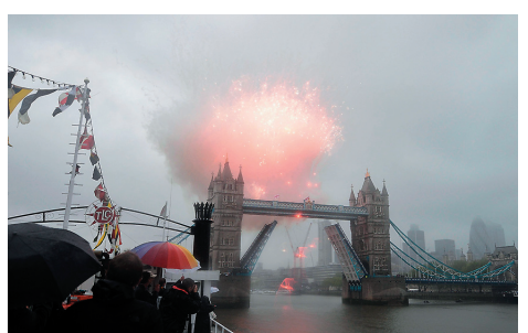
THIS ONLY MISHAP at the Diamond Jubilee came when this lovely bridge exploded.

Critics argued that the other boats intentionally threw the race out of fear of having their heads cut off, as is often English custom, but were dismissed by observers