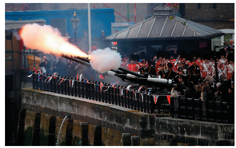
THE EXPLOSION UNFORTUNATELY appeared to be linked to these rowdy soldiers who were just having a bit of fun.