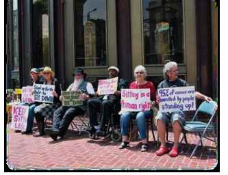
THESE NUTJOBS just don't get it that they should take turns on the few seats actually available for sitting and resting on downtown.