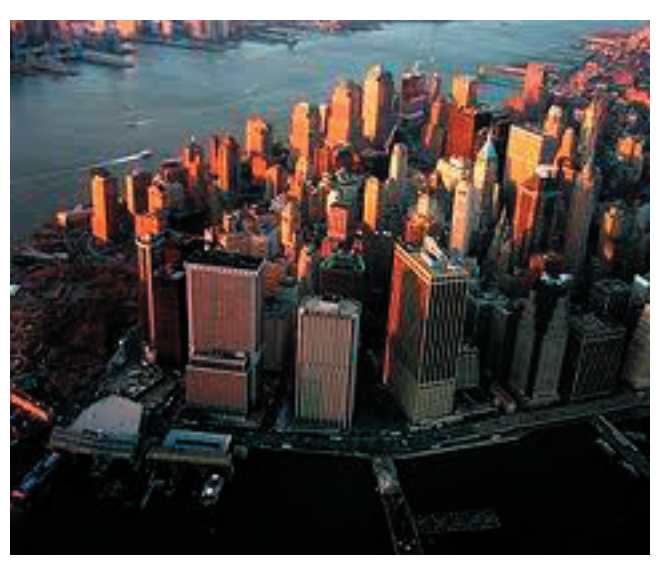
DON'T GET ALL RIGHTEOUS ABOUT losing your view when West Berkeley looks like this after the West Berkeley Plan is tailored for developers. Ducks really get in the way of economic progress and so do you.

Learn about birds from books or online instead of in real life! We know you love the migratory birds passing through the wetlands area near the shoreline, but there's no reason they can't alter their migratory course and rest somewhere more appropriate than around here.