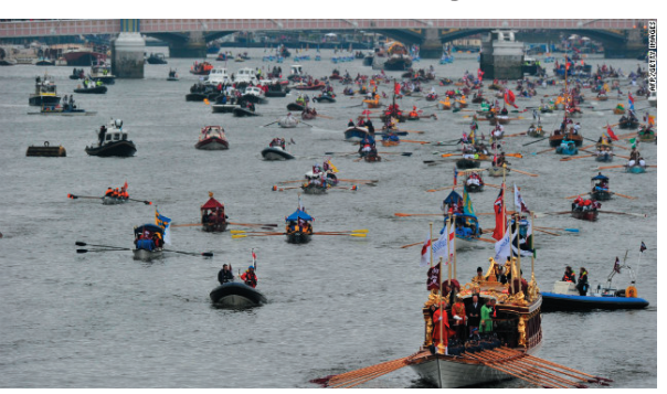
The River Thames was packed QUEEN ELIZABETH II RAN AWAY with the trophy in with an armada of rowboats, the Diamond Jubilee Regatta beating out, well, everyone.

who pointed out that the "silly hat edge", or "headgear headwind", was a serious advantage by any true sailor's measure, and cer-