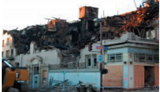
THE FIRE AND DEMOLITION at the corner of Haste and Telegraph had no effect on shoppers, who really enjoy this sort of challenge.