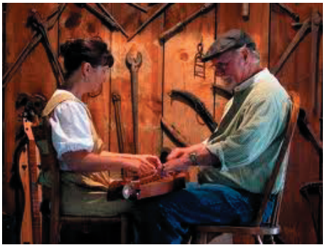
COURTING DULCIMERS are among the suggestions being considered by the Oakland Police Department to address the messy aspects of the current popular courting ritual, the sideshow.

Experts on ancient courting rituals agreed. "Gifts of thimbles, spoons, and knives would be safer, greener alternatives to spinning doughnuts in the middle of 580,"