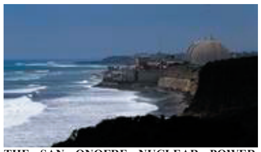
chance to show us how to use old-fash- PLANT wasn't just an energy source, it was also ioned toothbrushes, we would have had a an impressive and handsome addition to an otherwise barren landscape along the coast, architectural experts agree.

"They're laughing now," he warned, "but they won't find it so funny when they have migrating plumes of radioactivity like the people near the old Bevatron in Berkeley have now. The only thing worse than living next door to a nuclear power plant is living next door to a nuclear waste dump."