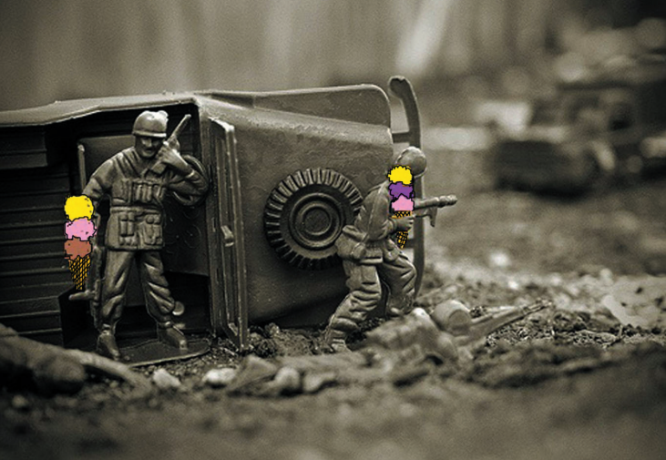
PEOPLE THINK THE ICE CREAM WARS are silly, but this photo is TRY TO IMAGINE YOUR MORNING COMMUTE if you're evidence that they are causing serious disruption in the streets, and need caught in the middle of the ice cream wars like the unfortunate the public's help in reporting trouble spots before they get out of hand.