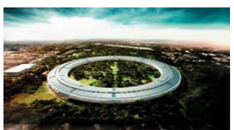
ADMIT IT: IF YOUR TOWN had its own big spaceship thing you'd be damn proud.

"It hasn't worked that way in this town," commented one observer. "The university is private when it wants to be, public when it suits it, and we pay the big ticket for all