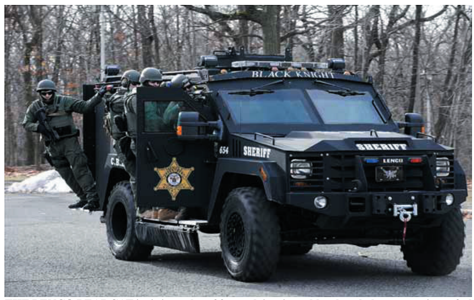
THE LENCO BEARCAT isn't just a lot of fun to drive, it enables the whole community to feel safer since it can annihilate out of control Solano Stroll or football revelers in short order.