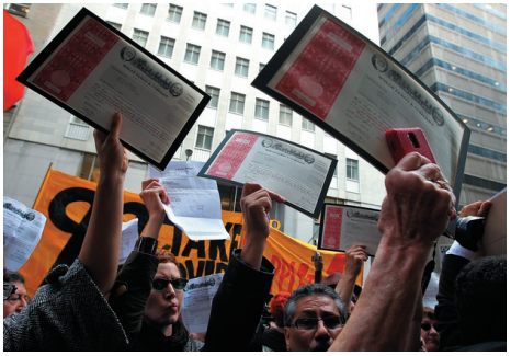
WELLS FARGO BANK had its shortest, liveliest shareholders' meeting ever when a bunch of Occupy protesters bought shares and came to the meeting.

"Snuffing out human lives may look cruel to some people," stated a spokesperson for J. R. Reynolds. "But to us it's just really good business."