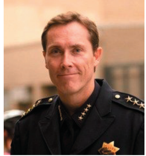
REMEMBER THIS GUY? He's not done banging on all the doors in Oakland and Berkeley, that is, unless you've called the police for help.

have been very good security reasons to retrieve the phone, the green windbreaker, and anything else the chief's son might have lost in the past year or so.