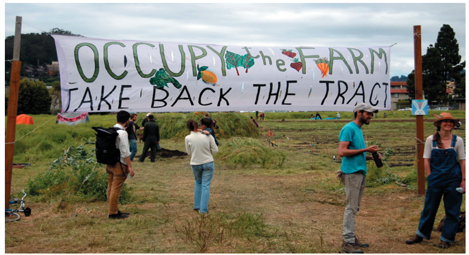
OCCUPY THE FARM gardeners agree that the University of California's effort to grow experimental corn without water is provocative, but eagerly look forward to seeing how well it works, no pun intended.