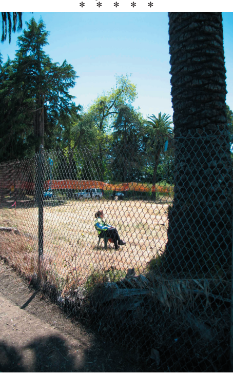
CAMPUS POLICE AND security staff were advised in the Robinson-Edley report to conduct simulations of responses to civil disobedience so that they don't look like this fool sitting in the middle of a field.

per spray somebody," added another. "We have no director," stated a sheepish UC spokesperson. "We're hiring some Occupy consultants, and hope for a more accurate and lively simulation soon."