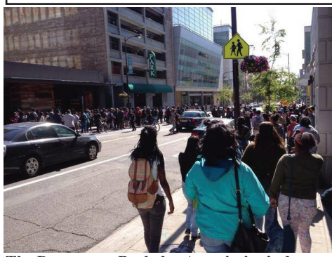
The Downtown Berkeley Association's dream of crowds of people downtown came true!