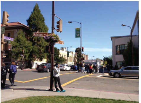
This young woman quickly alerted others not to come if they were young, or black, or Hispanic, etc.