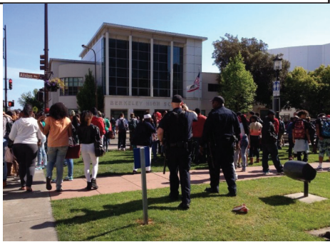
It was difficult, but they managed to clarify that Berkeley's streets were for a different group entirely.