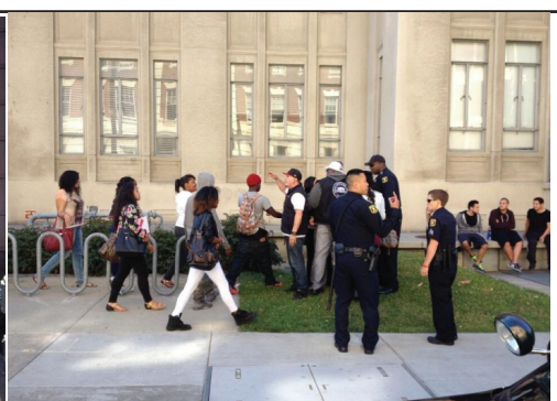
Of course, they were the wrong people, so the police came out to be as helpful as possible.