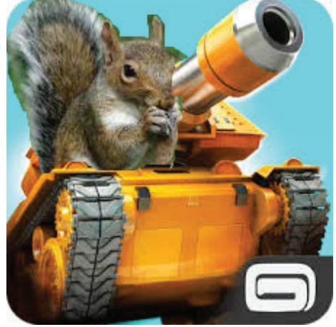
THE REDISTRICTING CONTROVERSY is considered responsible for stirring up the ground squirrel population which is conversant with the tools of modern warfare and has been watching the drone innovations with interest.

"It goes without saying that meetings about our working conditions should be