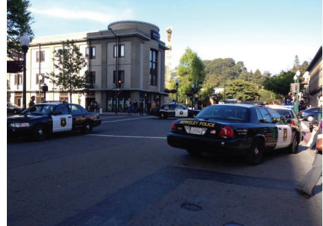
Eventually the crowds went home, the police got lots of overtime, and the DBA went on hoping for visits from the right people.