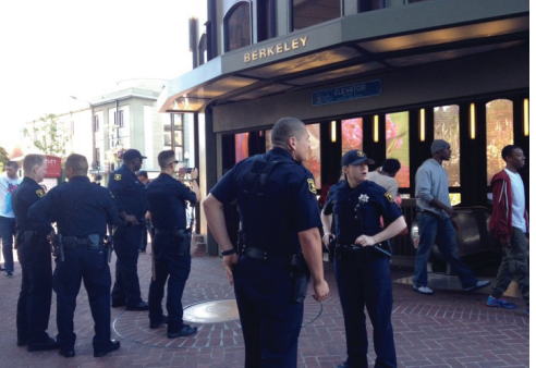
The police formed an informational picket line at the BART station hoping to discourage the wrong people from walking around.