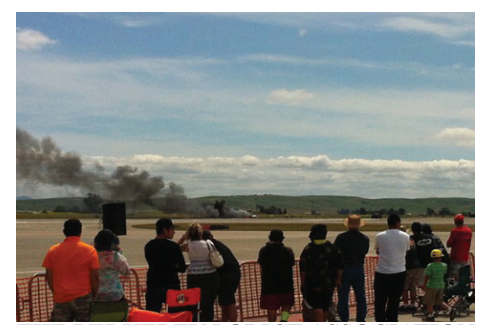
THE BERKELEY POLICE ASSOCIATIO wants to make it clear that this tragedy would have played out very differently if the Berkeley Police had tasers as a part of their "toolkit" of optional weaponry.

Critics objected that both pepper spray and tasers are lethal for a predictable ratio of any given population, but the police pointed out that they can't help that.