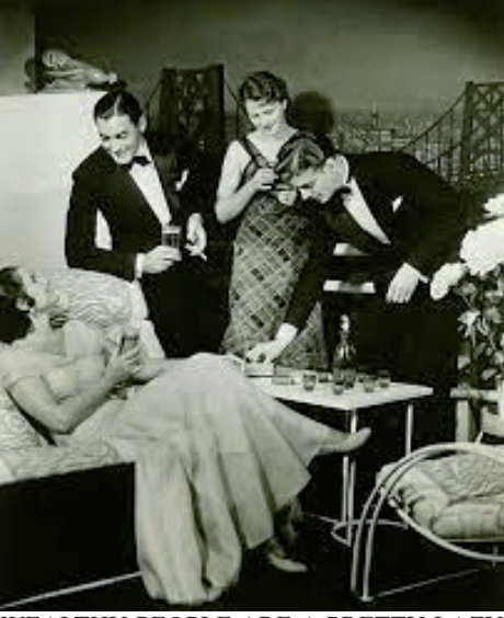
WEALTHY PEOPLE ARE A PRETTY LAZY bunch sitting around in salons talking about expensive food and planning vacations.

ing simply jailing poor people for not being able to afford high-end housing or who don't qualify for the latest scheme of luxury student housing create tent cities across the nation, they set their municipal legal staff