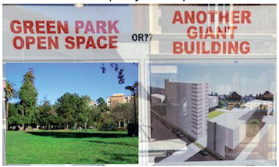
THE BERKELEY CITY COUNCIL UNANIMOUSLY recommended that all parks get the "People's Park treatment" which will make even more room for preferred populations of wealthy people.

Every new unit promised pack of seeds and a pretty flower pot.