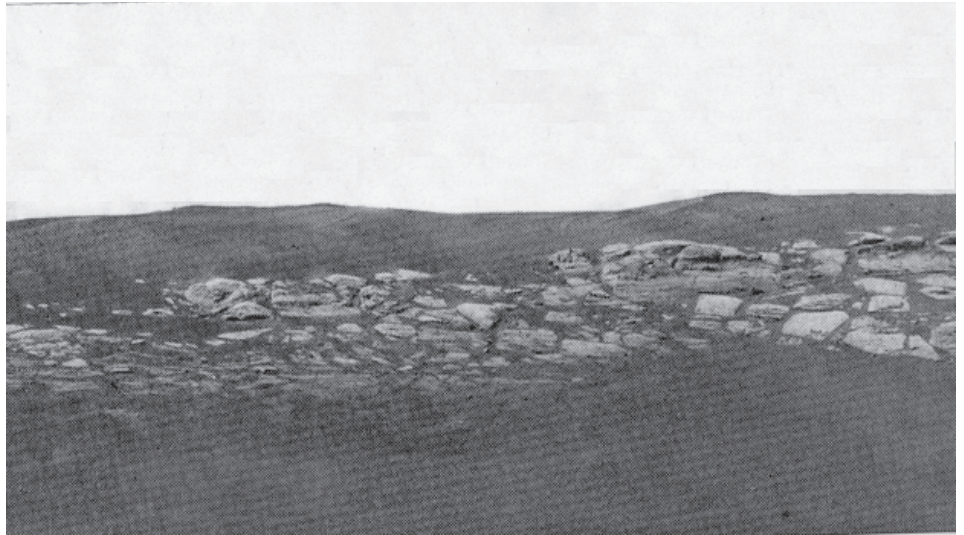
THE MARS LANDSCAPE appears to have very little nightlife and hardly any atmosphere.

Conservative groups nationwide nodded in sober agreement that San Francisco's wanton display of disrespect for all that is good and decent would probably auger the end of the world as