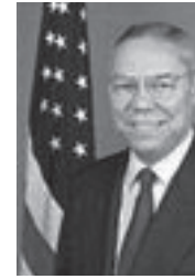
Colin Powell changed his perspective on weapons of mass destruction after giving the matter some serious thought.