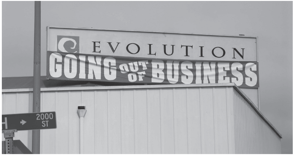
CLIMATE CHANGE IS HAVING the predicted effect on business, although startups in natural products, such as water, might prove wildly profitable.

Do not enter a room without first knocking and receiving an invitation to come in.