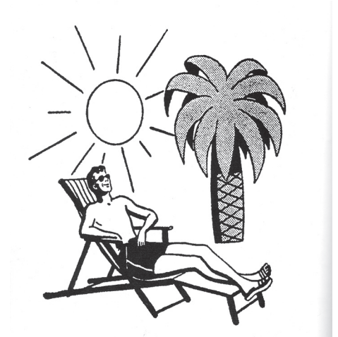
LIFE GETS EASIER if you subscribe to the Pepper Spray Times.