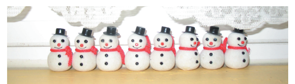
ONCE THOUGHT CHARMING, congregations of smiling snowmen are now considered an ominous signal of global warming and a dangerous consequence of the loss of snowman habitat, a new concern for humans, who are unnerved when snowmen show up in their large freezers.