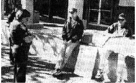
LOCAL LANDLORDS feeling left out of campus Tenants' Rights Week festivities decided to crash the party.