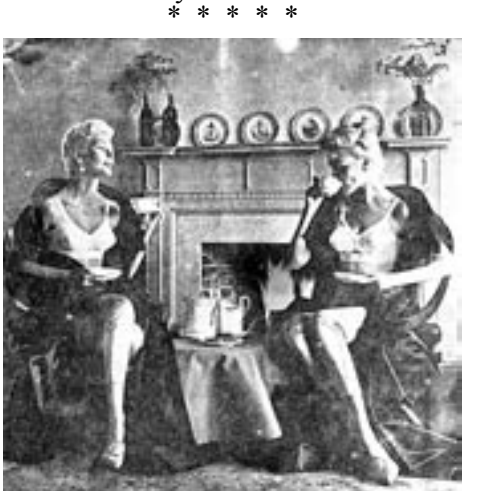
I dreamed I voted for Bush

"She has a good point," commented one homeless woman selling items on a blanket near the on-ramp. "But let her know that if someone finds me a living room I'll do my best to fit it in."