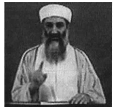
BIN LADEN'S LATEST VIDEO is not making the critics' top ten list.