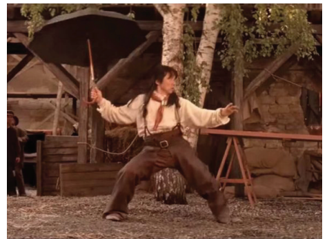
WONG FEI-HUNG's umbrella skill is legend world-wide in films like "Iron Monkey" which may or may not have led to the Berkeley Public Library's eighteen inch rule.

"The Hong Kong protesters may not have used the umbrellas in an aggressive manner