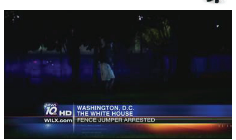
YOU MIGHT END UP with a court date for jumping the White House fence but you can count on getting on tv.

The IOC responded to critics by pointing out that other ridiculous and long derided sports such as water ballet and ribbon