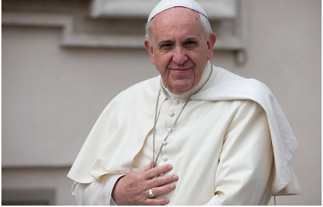
NOBODY CAN TELL if Pope Francis is seri ously embracing evolution or if he just loves to scare the crap out of his cardinals.

10. Offer the fence-jumpers a tv interview before they jump instead of after.