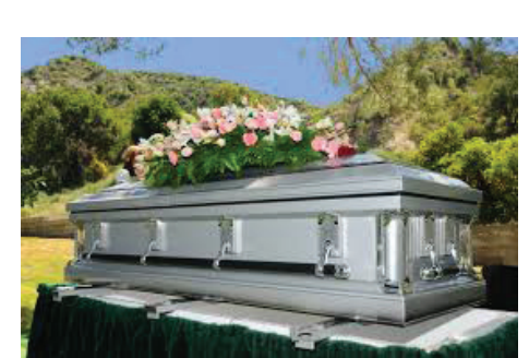
A HIGH-END COFFIN is really a very nice way to go both before or even after you die and can also be used as a toolbox.

"Stacked shipping containers may not be everyone's first choice for a home," acknowledged Friedlander, "but neither is the Millenium Tower anymore."