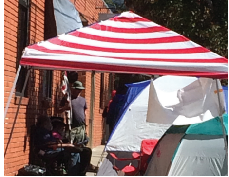
THE bERKELEY fOOD AND hOUSING project finally has the welcoming committee it has long needed right outside its doorway.