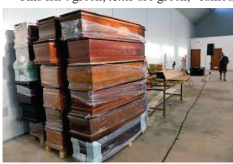
COFFINS ARE AN EFFICIENT way to use space, as cemetary staff have known for centuries, so this is very green.

"This isn't green; tents are green," fumed