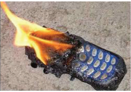
EXPLODING PHONES MIGHT SEEM like a hazard, but there's an upside to giving one to someone you just can't stand.

homelessness to anyone who needs them, according to Editor Grace Underpressure.