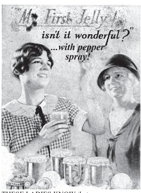
THESE LADIES KNOW that pepper spray can pep up their jellies and jams for holiday gifts that the neighbors will talk about for years!