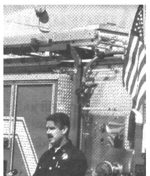
BERKELEY FIREFIGHERS finally decided that the American flag was not in and of itself an incitement to violence.