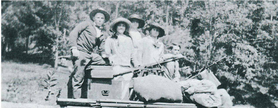
ORDINARY WORKING FAMILIES like this one deeply appreciate the Berkeley City Council's willingness to reduce their salaries, so that they don't lose touch with the hardships of being low-income in the Bay Area.