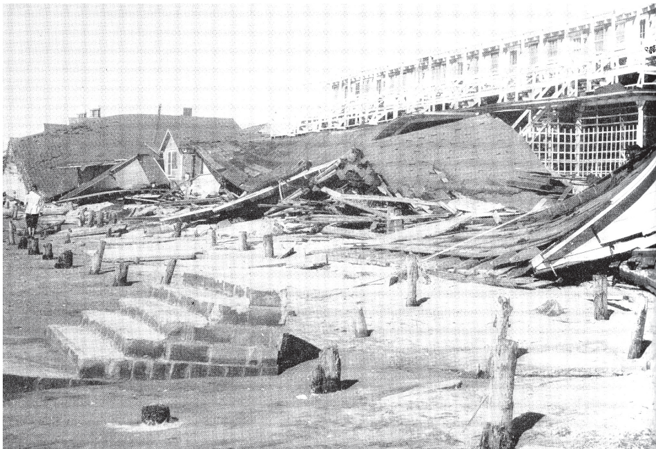
REGULATORS ARE BAFFLED at the destruction of Wall Street, and can't find any clues as to who ran off with all the money.