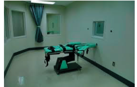
WHO WOULDN’T WANT to die in this state-of-the-art new death chamber with all the best amenities.