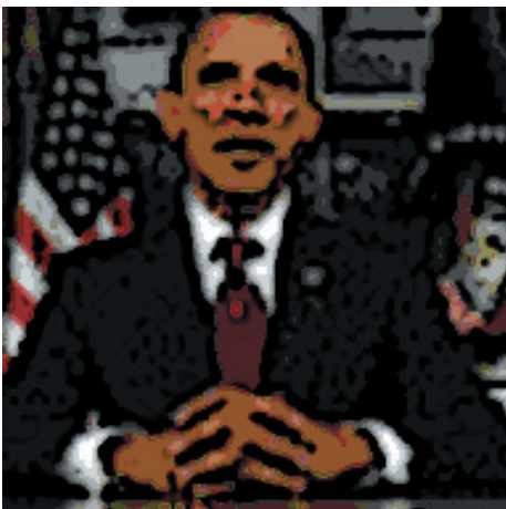
"It's time to turn the page on the Iraq war."