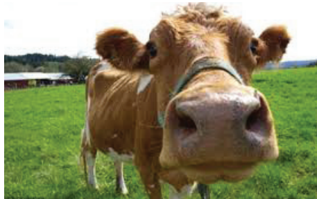
COWS CONFESS that while conductive electronic devices are uncomfortable, they do enhance one's motivation to get out of the barn in the morning.

Critics demanded to see the local crops, dubious as to tasers' pesticide content and the treatment of the farmworkers required to harvest them, but