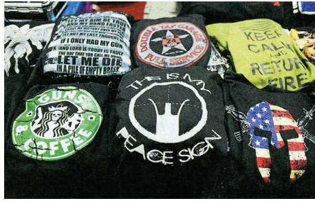
THESE PLAYFUL T-SHIRTS convey the general attitude toward protesters at the convention.

Experts are providing some suggestions for potential October Surprises to watch for hoping to lessen the jolt for the