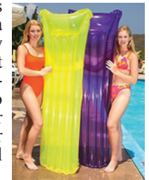
CLIMATE CHANGE'S re-branding focuses on colorful pool toys and playful water sports.

"The economy stand to benefit as much from this disaster as from any war," stated one expert. "You just need to have the dough and pick the right broker."