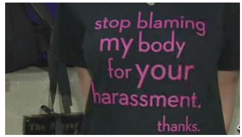
SOME WOMEN JUST don't understand how distracting they are to boys and refuse to take responsibility for causing disruption and unruliness in young men.

phenomenon in K-12 schools, and it has a