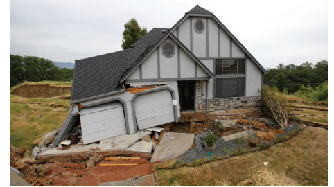
CALIFORNIANS RICHLY DESERVE having stuff like this happen to them because they are so full of themselves with all their surfboards and stuff.

Snotty, Entitled State Residents Don't Deserve Any Sympathy