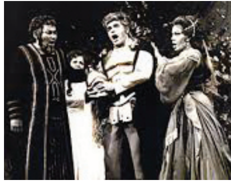
REPUBLICAN CANDIDATES thrilled the na tion with brilliant arias.

My kid's teacher has to move another rent increase.