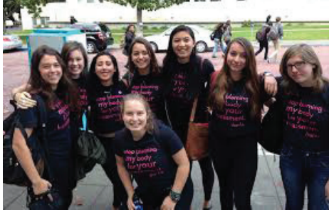
THESE YOUNG WOMEN JUST don't understand that whatever they say comes out sounding like blah blah blah blah.