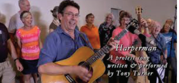
policies, but pointed out that folksingers, as a rule "belong in jail." FOLKSINGERS SHOULD KNOW BETTER than to criticize hard-working conservative politicians over some piddling polar bears and migratory birds who don't vote anyway.

"Folksingers used to know their place," he stated. "They used to wait until the wee hours and just mumble in the back of a bar, which nobody minded. Now it's getting out