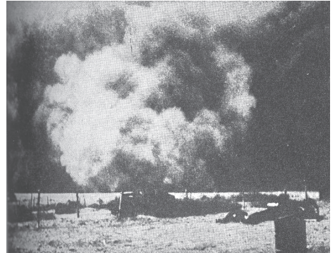
THE NEXT DUST BOWL will be better, since science has better descriptive terms for it like "desertification" and stuff.

ment of Agriculture and the transnational agribusinesses which benefit most from its policies.