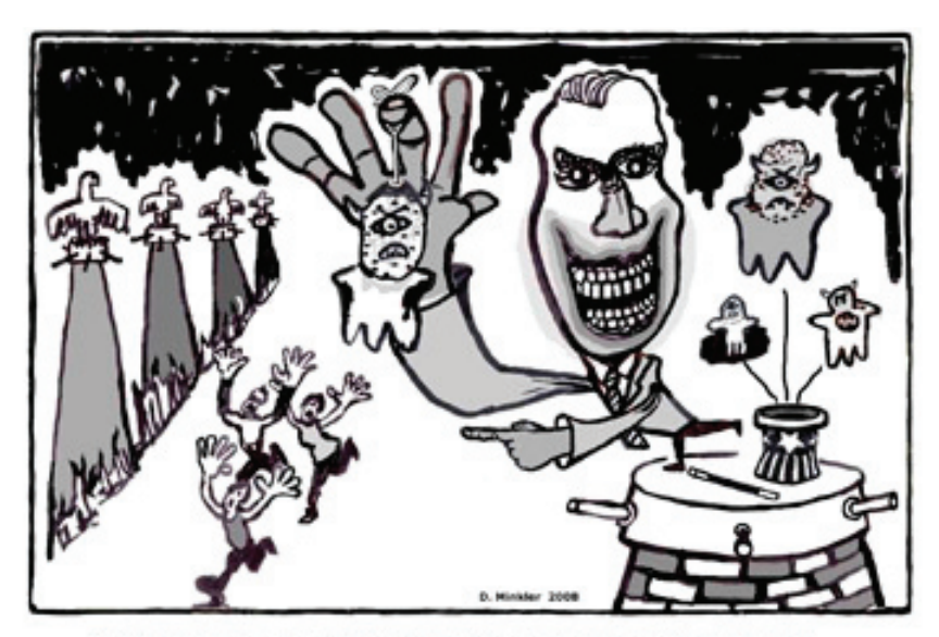
The whole aim of practical politics is to keep the populace alarmed (and hence clamorous to be led to safety) by menacing it with an endless series of hobgoblins, most of them imaginary.

Authorities promised that the next national convention will have state-ofthe-art mass detention facilities.