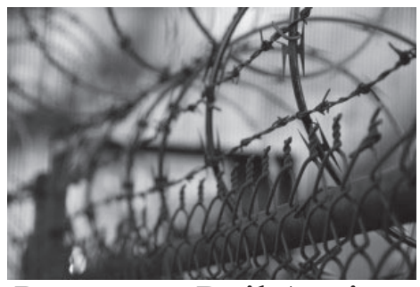
Protestors Rail Against Democratic National Convention Lockup

Mass Detention Facility Has No Wireless Internet Connection