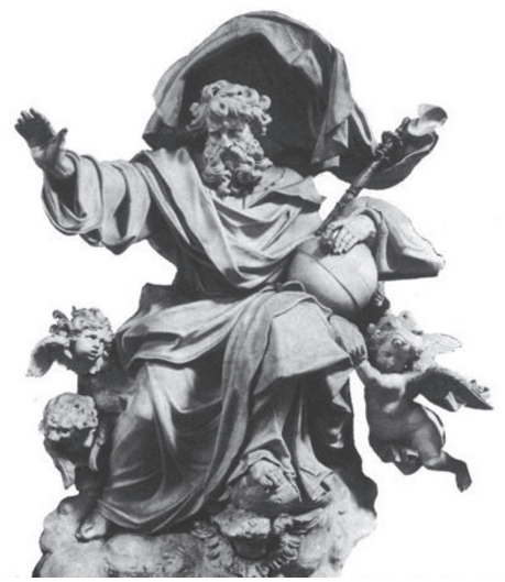
GOD SAYS THE BIBLE was just a short grocery list when it left his desk, and is now pretty much unrecognizable.

Record earnings for the second quarter income rose 14 percent, to $11.68