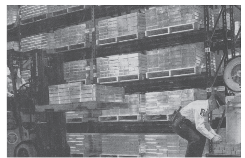
THIS IS HOW RICH poor countries would have been if they were more trusting and stuck with the WTO.

"They stopped thinking long-term," they nodded. "Suicide is so selfish. Hunger is important, but profits require a long-term perspective."