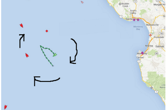
TURNING CIRCLES is a blast in a really big ship according to Israeli-owned ZIM Lines which insists its giddy display had nothing to do with any blockade.

"San Francisco Bay is notorious difficult to navigate," asserted a local official, noting several accidents in recent