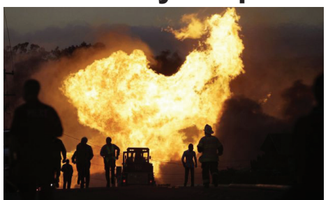
PG&E IS UNDER FIRE from critics who misunderstand its need to provide guidance for state regulators right down to the fonts and logos.