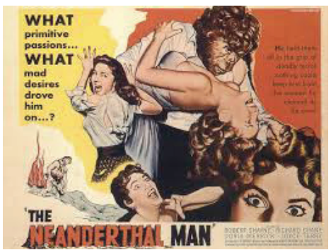
NEANDERTHALS are often victimized by distorted media representations when in fact they make wonderful neighbors and will babysit for free.

The scientific team agreed that their find-