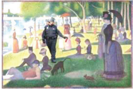
OLD-FASHIONED pepper spray requiring the sometimes messy involvement of hardworking police officers will soon be a thing of the past.

Chaotic Moon had unveiled an unmanned "Personal Intercept Drone" at the recent South by Southwest Conference which was