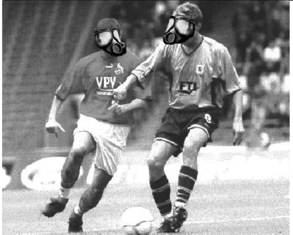
SOCCER PLAYERS at Harrison Park soccer field sport fashhionable headgear in an effort to adapt to the really, really sucky air quality.